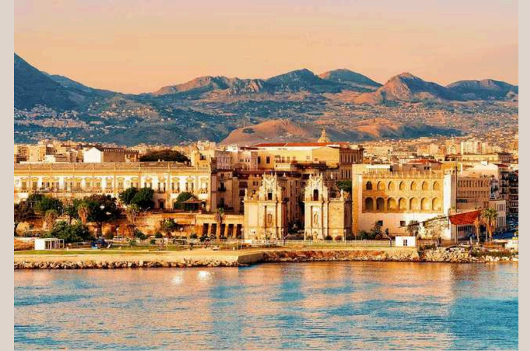
Authentic Italian gems