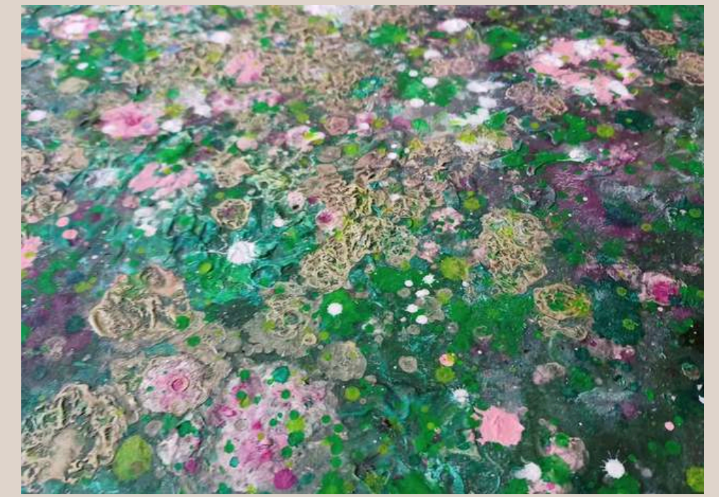
Committed to sustainability