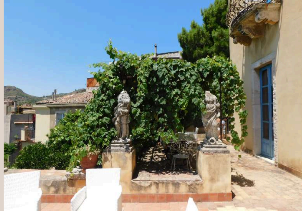
Carefully chosen venues

We're here to guide you through the discovery of unveiled locations and support you in organising your international and impactful events.