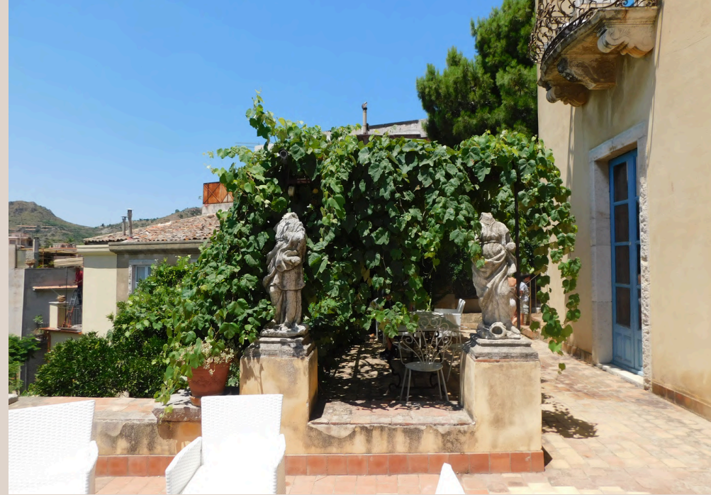
Carefully chosen venues

We're here to guide you through the discovery of unveiled locations and support you in organising your international and impactful events.