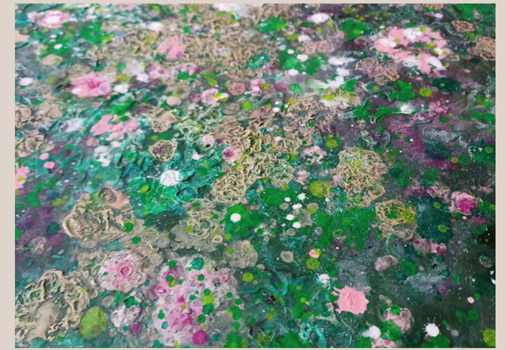
Committed to sustainability