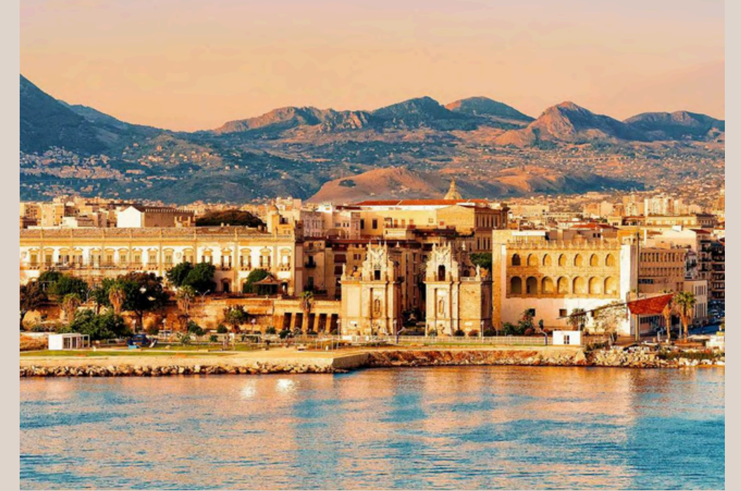
Authentic Italian gems